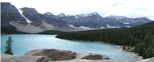
GMM News Issue 239 Dec 2007 & Jan 2008

Twelve Conditions: (Continued from last issue)